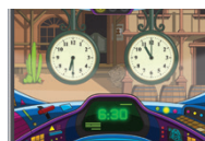
Hour & Half Hour

Players practice telling time to different intervals: hour, half-hour, quarter-hour, and five-minute intervals.