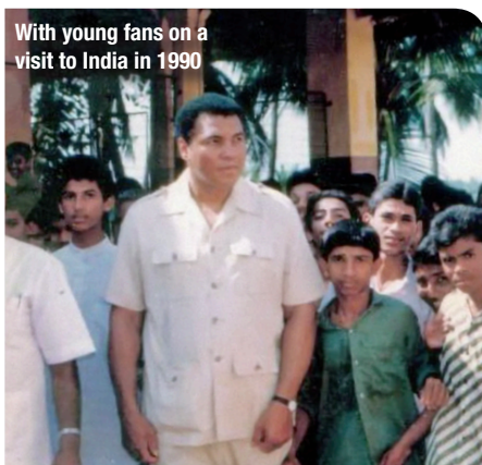
With young fans on a visit to India in 1990