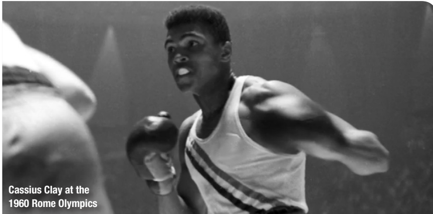
Cassius Clay at the 1960 Rome Olympics

See “The Greatest” in action! Watch these film clips from What’s My Name: Muhammad Ali to learn about Ali’s accomplishments and hear his views on civil rights and social justice.