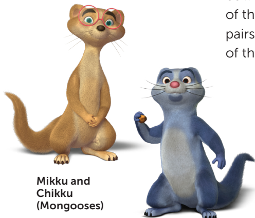
Mikku and Chikku (Mongooses)