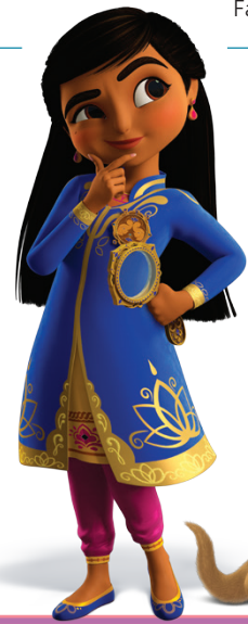
Mira, Royal Detective, with Mikku

Tip: If there's an item your child can't find, challenge them to think creatively. No triangles in sight? Make a family triangle! Can't find the number 5? Line up five blocks.