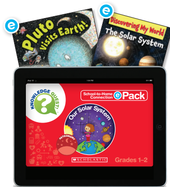
Our Solar System ePack