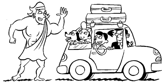
Muscle Man shows the family his stuff as they take-off.

There have been several "Herky" sightings around the city, but no one has been able to take a picture of him until now. Some people just want to be heroes.