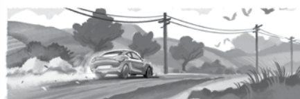
Spencer and Uncle Mark’s departure from the city turns into a high-speed car chase! (page 11)