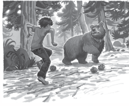
Kate trains Spencer in the art of Bear Stealth. (page 106)