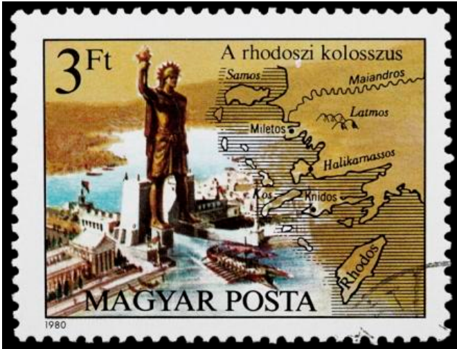
Colossus of Rhodes, ~304 B.C. Wonder of the Ancient World

How do allusions help to unlock the meaning of a poem?