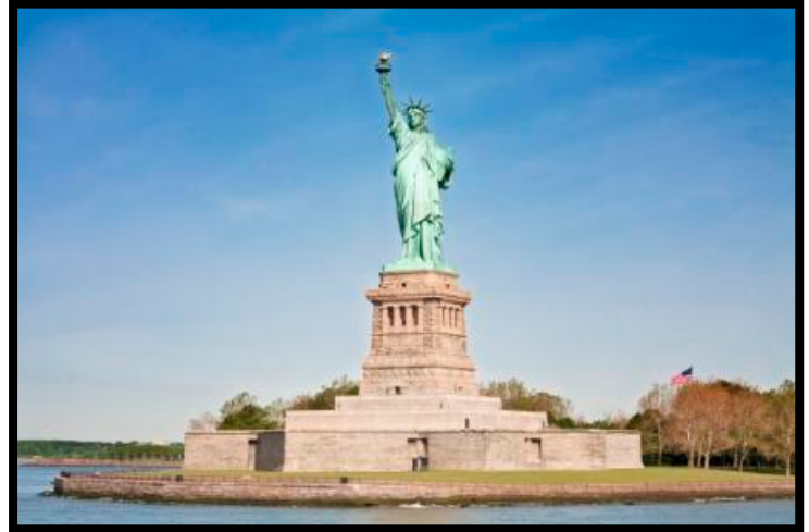
Statue of Liberty, 1886 Auguste Bartholdi, Sculptor