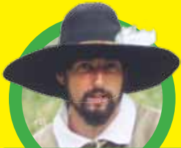
Pilgrim adults (could be teacher)

Assign your students roles. Then read the play.