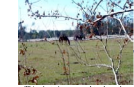
This photo is supposed to show the viewer the openness of the pastures.