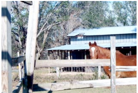
In this picture I was trying to capture the "rule of thirds" w/ Hill (the horse) as my subject.