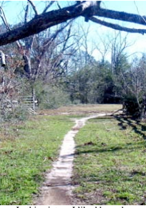
In this picture I liked how the branches formed an overhang framing this trail.