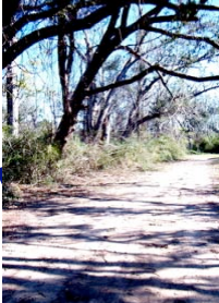
I liked this pic b/c of the way these trees formed an overhang over the road. I thought this would make an interesting effect.