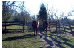
This photo shows how much freedom the horses have, and it has nice lines and the subject is very clear.