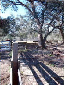
This pic had great lines in it b/c it shows the fence line/posts, the shadow also created a desired effect.