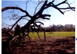
I liked this picture b/c of this unique tree, I thought this was an awesome tree, and I wanted the viewer to see how huge the trees here are.