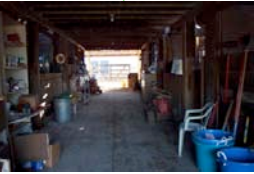
I liked the way this pic created a focal point, the light at the end of the barn.