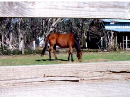
In this picture I went for the "framing your view" affect.

In these two pictures I am framing the view. The tree and the fence both act as natural frames.