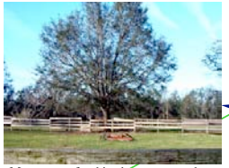
My purpose for this picture was to show what a contrast these huge trees had against the open skyline.