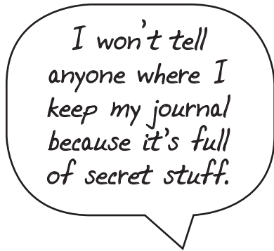
1. Her secret journal