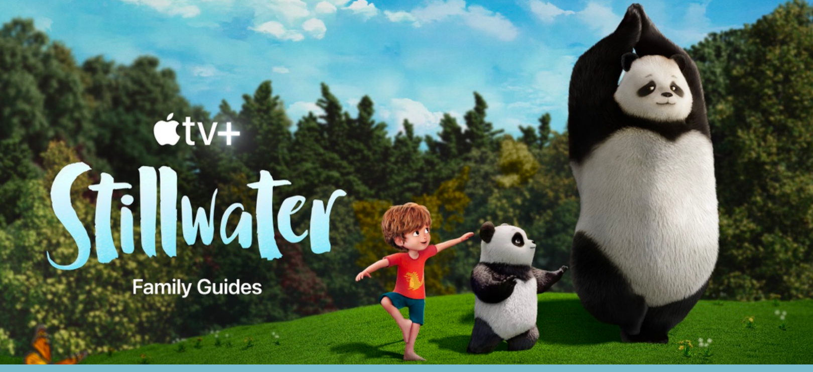
Season 3, Episode 9: The Catch / Missing Out