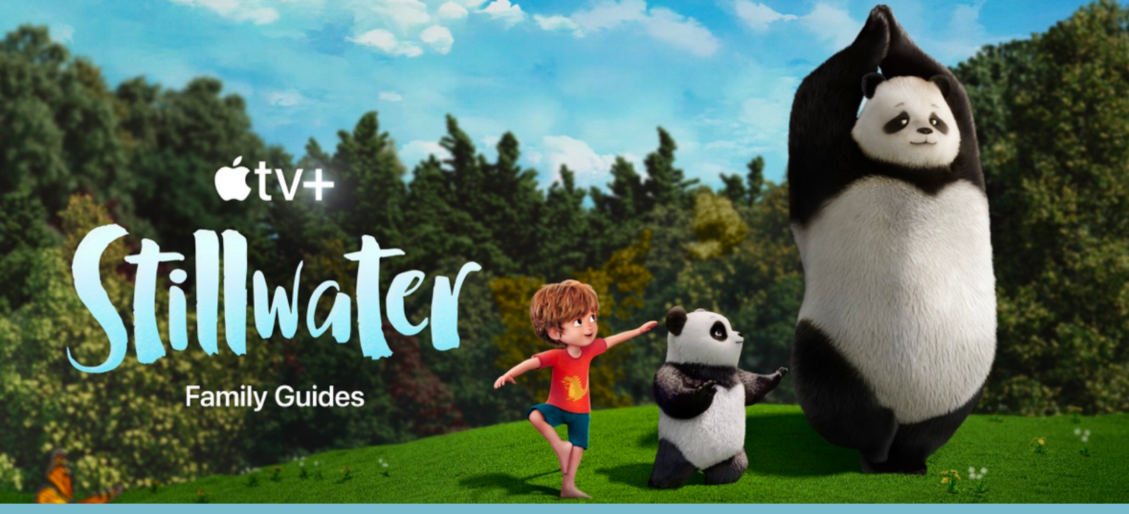
Season 3, Episode 7: The Catio / Campout