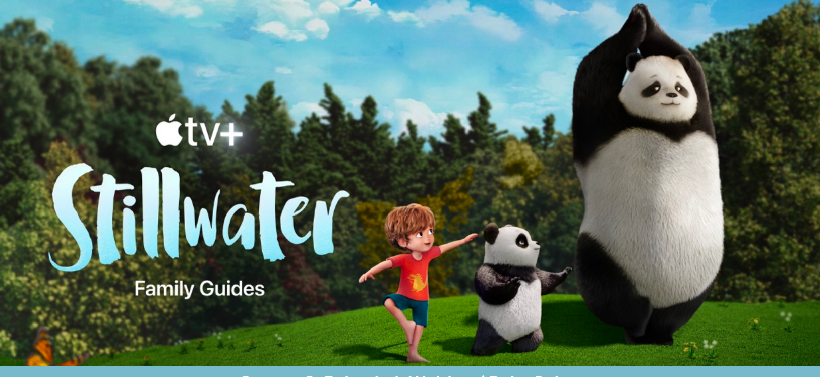
Season 3, Episode 1: Waiting / Bake Sale