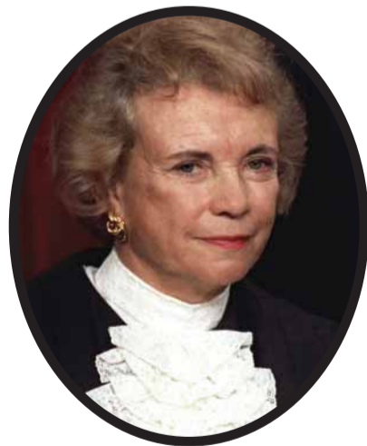
Sandra Day O'Connor