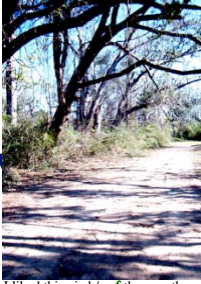
I liked this pic b/c of the way these trees formed an overhang over the road. I thought this would make an interesting effect.