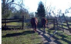
This photo shows how much freedom the horses have, and it has nice lines and the subject is very clear.