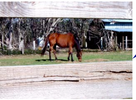
In this picture I went for the "framing your view" affect.

In these two pictures I am framing the view. The tree and the fence both act as natural frames.