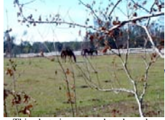
This photo is supposed to show the viewer the openness of the pastures.

In these pictures it shows the horses of the barn, and portrays how happy they are here.