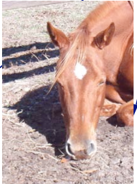
In this picture I wanted to capture the peaceful atmosphere of the barn by capturing this horse taking a morning nap.