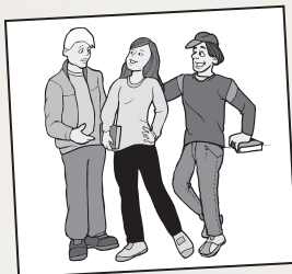
three local high school kids