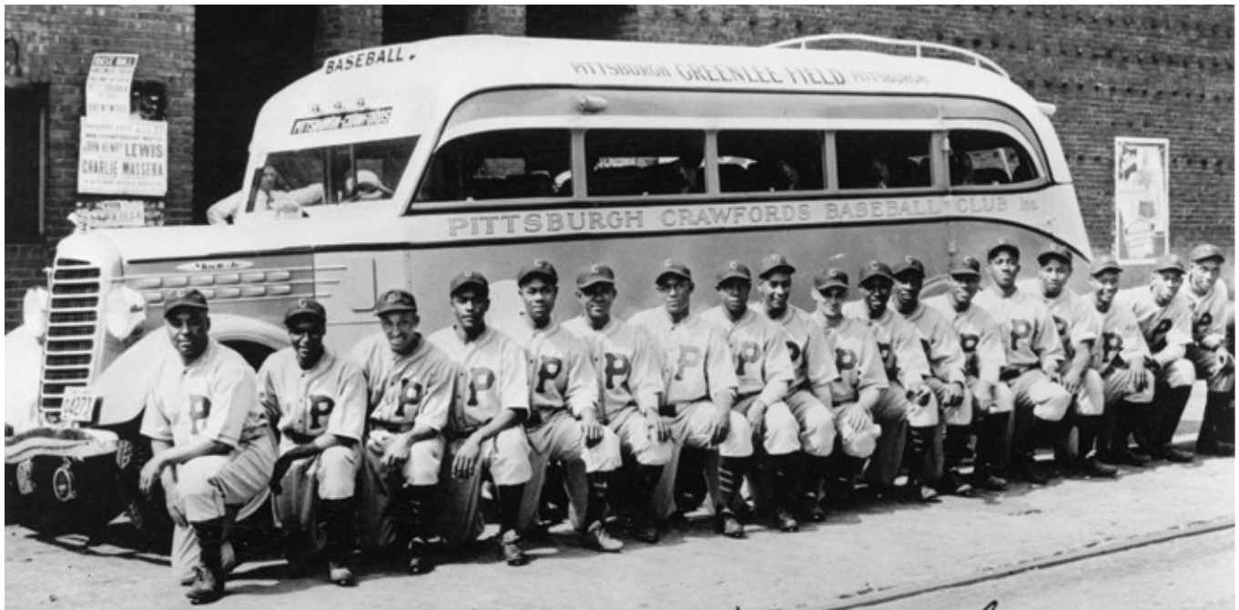
The 1935 Pittsburgh Crawfords of the Negro Leagues pose for a photo in front of their team bus.

Negro League players showed great teamwork and worked hard to impress the crowds. They developed an exciting style of play that was fast and daring. Players often stole bases and made opposing