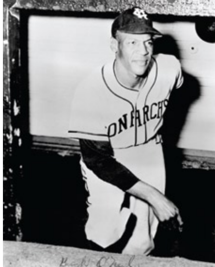
Satchel Paige (left) and Buck O'Neil (above), both of the Kansas City Monarchs.

a great hitter with 900 career home runs. He could hit a ball more than 575 feet. Both Paige and Gibson were later inducted into the National Baseball Hall of Fame. Buck O'Neil had a great career with the Kansas City Monarchs. He later became the first African-American to coach a Major League team, the Chicago Cubs. After he retired from baseball, he helped