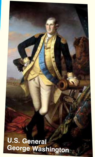
U.S. General George Washington

These leaders were enemies—but they were similar. Both men were popular and cared about their countries. Both were farmers. And both were more than 6 feet tall, in a time when most men were much shorter.