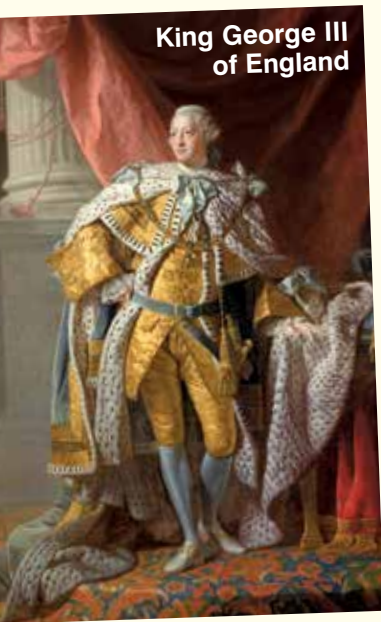
King George III of England